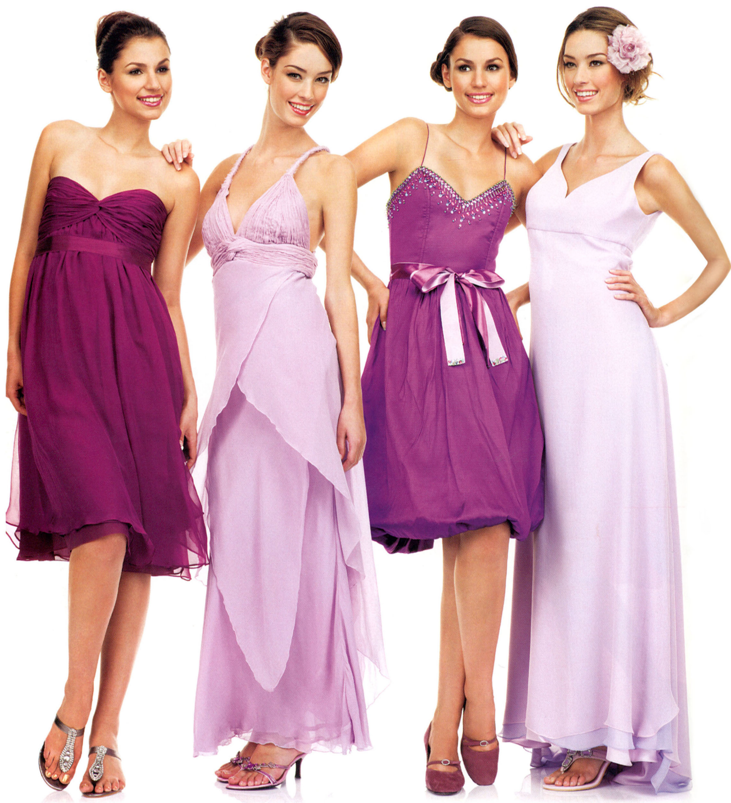
From left: Dress, price unavailable, Hugo Boss; shoes, RM250, Shoes, Shoes, Shoes. Dress, price unavailable, Milo @ Aseana; shoes, RM279, Charmain. Dress, price unavailable, Salabianca; shoes, RM89, Studio. Dress, price unavailable, Eric Choong; shoes, RM260, Shoes, Shoes, Shoes.