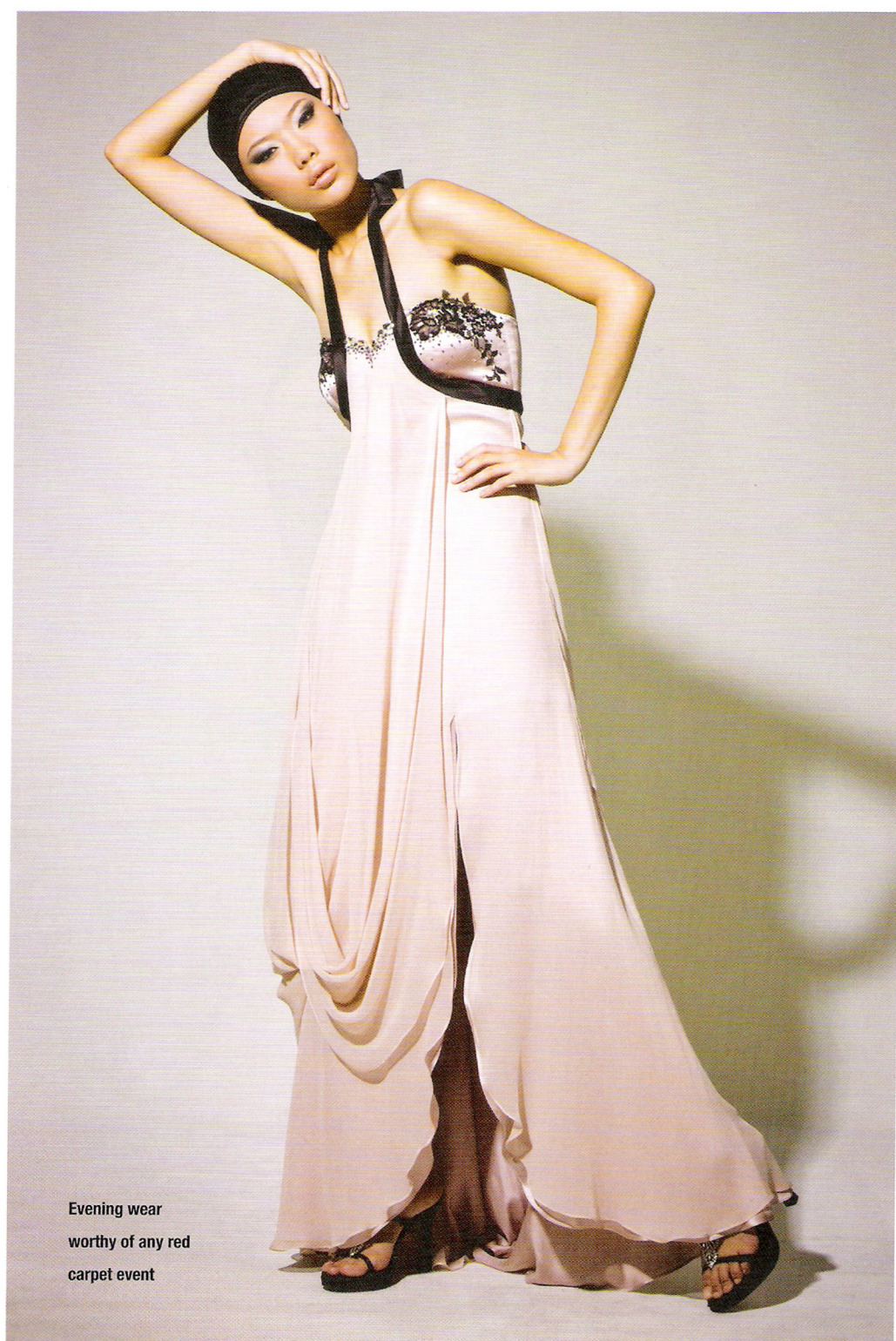
Evening wear worthy of any red carpet event